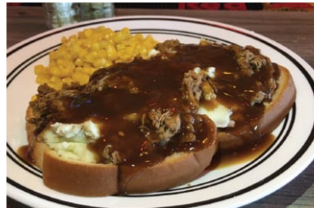
OPEN FACE ROAST BEEF WITH MASHED POTATOES AND CORN