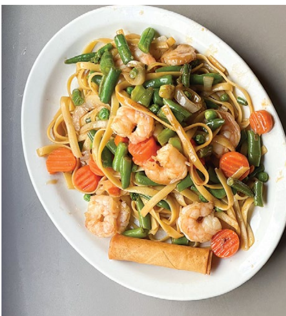
SHRIMP PANCIT AND CHICKEN BIHON