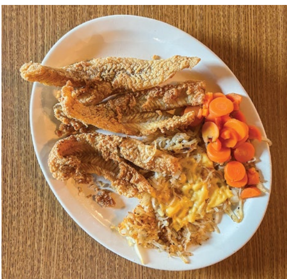
FRIDAY SPECIAL: AYCE FRIED WALLEYE