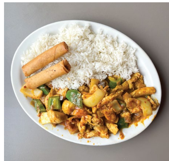
SWEET AND SPICY CHICKEN CURRY