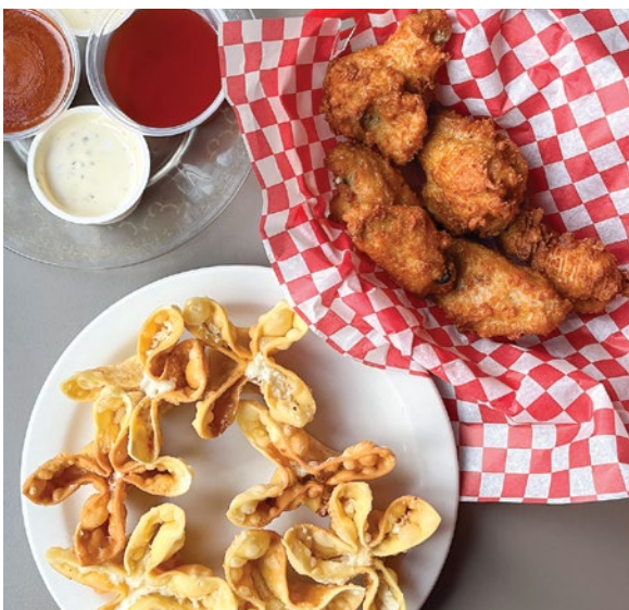
CRAB RANGOONS AND WINGS

But let's start with the original Big House menu. A big appetizer list has all of your usual deep-fried favorites (curds, shrooms, poppers, and chicken strips) plus a couple of special offerings like Harry's Reuben Balls, chicken gizzards, homemade lumpia (Filipino egg rolls),