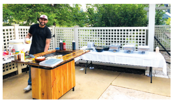
PRIVATE EVENT SETUP