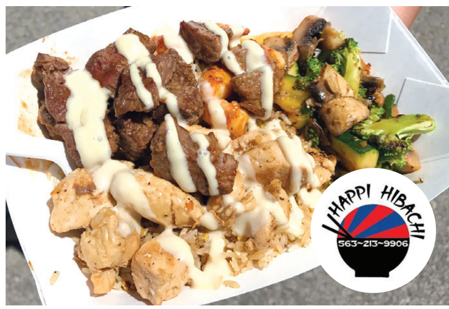
SUMO SPECIAL ENTRÉE

They use fresh ribeye steaks in their meals; in fact, everything starts fresh each day the truck sets out. Reza painstakingly prepares all of the ingredients from scratch to get the flavor he's happy with. It's a lot of work. Starting early in the morning Reza cuts all of the vegetables for the day, never relying on precut packaged veggies. He admits that the morning prep is the hardest part of the day. And that is saying something considering how hard I saw the whole crew working when I visited the truck at the Jule Intermodal Center's recent Food Truck Friday event. After two hours of cramped cooking in a confined space with