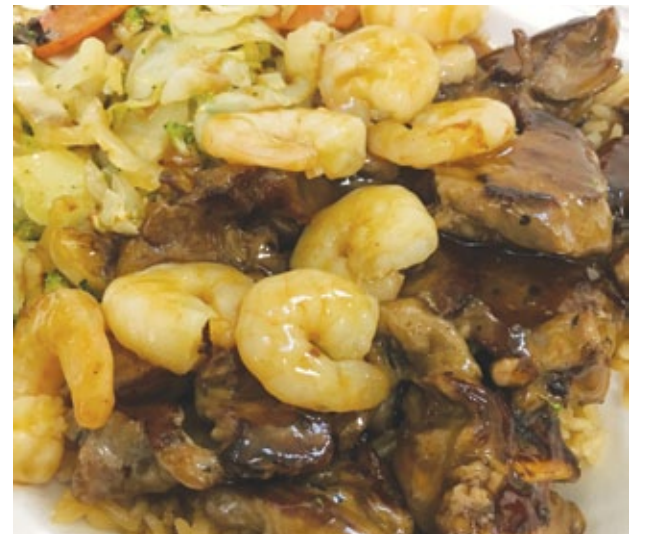
BEEF AND SHRIMP TERIYAKI WITH FRIED RICE

There are surprisingly tasty Hamburgers, Hot Dogs and even Gyros sliced from a vertical rotisserie. I also recommend the Chicken Strips and Chicken Wings served with your choice of BBQ, ranch or Hot Sauce for dipping.