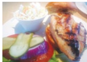
↑ Jumbo Breaded Tenderloin and Chicken Sandwich

Other lunch favorites include a Pulled Pork Sandwich with hickory house-smoked pork topped with BBQ sauce, and the grilled or crispy Chicken Sandwich. In my opinion, the best sandwich is the Jumbo Breaded Tenderloin. Chef Tyler cuts whole pork loins into filets, tenderizes them, coats them with a mixture of Panko bread crumbs and parmesan cheese and then fries them.