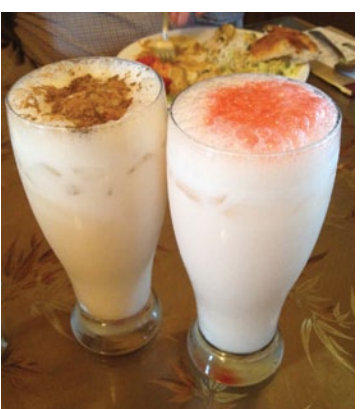
{september 2012} 365ink Magazine • www.dubuque365.com