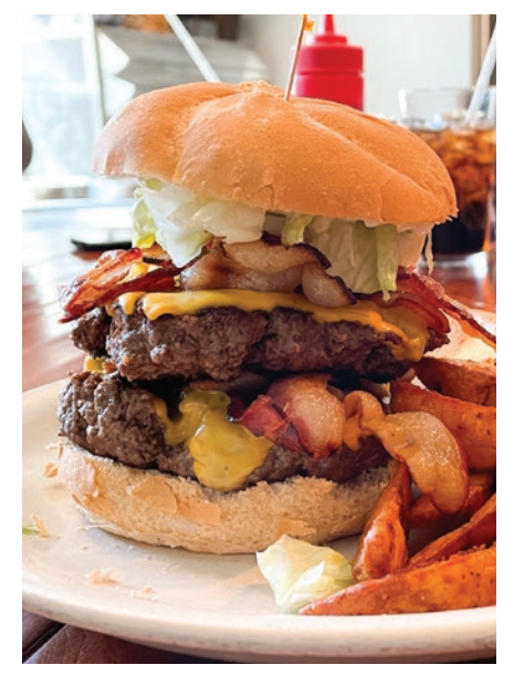
BIG JOHN BURGER

melted mozzarella cheese on top. Finish it off with au jus for dipping, and you have a winner on your hands. The basket version was $12 and worth every penny.