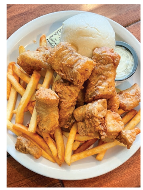
POLLACK WITH FRIES

The rest of the menu is sandwiches, but with more than 40 specific options called out, that means a lot of variations come between those buns. A list of specialty burgers has a few curveballs like the Zesty Zephyr Burger, featuring Cajun spices, jalapeños, and pepper jack. You'll want a backup beer ready before you dig in. The burgers are joined by a selection of likewise amendable chicken sandwich options, as well as some deli-style sammies like a club and a BLT. They also have seven featured wraps, from steak and cheese and Philly to a turkey bacon ranch and a Santa Fe.