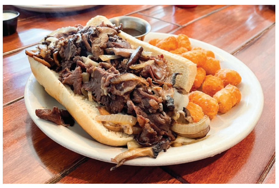
ULTIMATE PRIME RIB SANDWICH