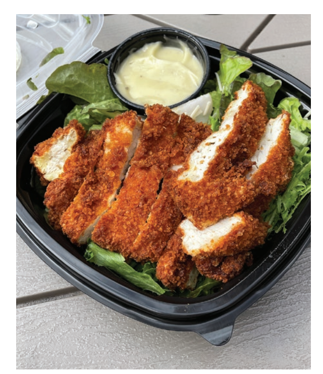
BIRDS. FALL SALAD