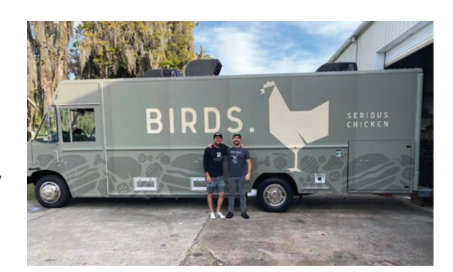
Birds. Serious Chicken FACEBOOK.COM/BIRDS.FRIEDCHICKEN INSTAGRAM.COM/BIRDS.FRIEDCHICKEN