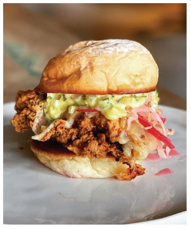
A FUTURE BIRDS. CHICKEN SANDWICH

So, now... the big question. How do you get your mitts and mouths on one of these amazing sandwiches? The best way to find out where the truck will be and when is to follow them on Facebook and Instagram @birds.friedchicken. They plan to announce on each Sunday or Monday where they will be each day that week so