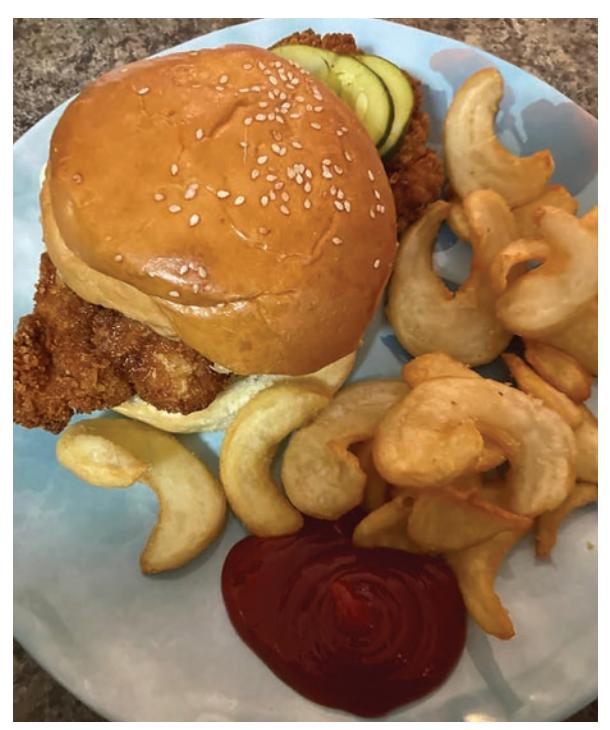
FRESH-CUT POTATO PEDALS

There is also the Spicy Bird. Sandwich ($12), which highlights Cry Baby Craig's hot sauce out of St.