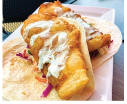
1ST & MAIN