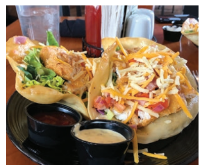
HOPS & RYE