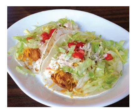
WEST DUBUQUE TAP